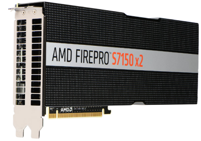
AMD FirePro™ S7150 x2 Server GPU