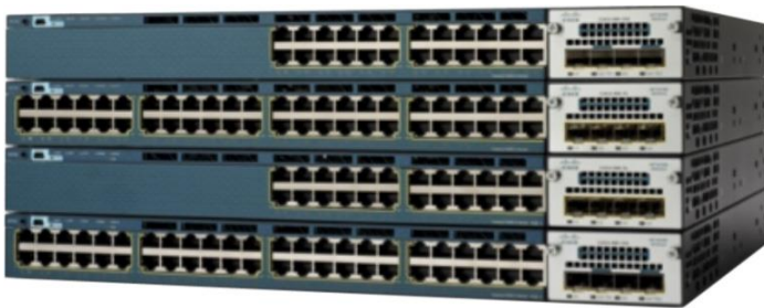
Figure 2. Cisco Catalyst 3560-X Series Switches

Table 2 shows the Cisco Catalyst 3560-X Series configurations.