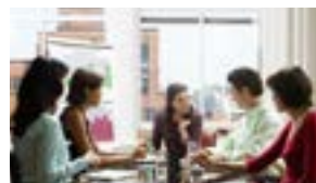
With View-DR function