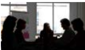
Without View-DR function

SRG Series cameras provide superior picture quality by incorporating a sophisticated 1/2.8-type Exmor CMOS image sensor. They provide smooth, crisply detailed, full-HD (1920 x 1080/60p) images with extremely low noise. High frame rate (60 fps) operation ensures smoother, more fluid reproduction of moving subjects. In addition, outstanding View-DR™ technology expands the dynamic range for clear images under harsh backlighting with extremes of light and dark in the same scene. XDNR™ technology reduces image noise for crisp reproduction of still and moving objects in poorly illuminated rooms.