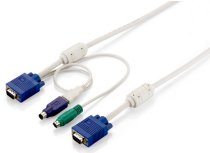
ACC-2101 1.8m PS/2 and USB KVM Cable