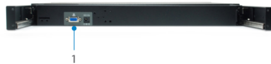
1. KCM Moudule Connector