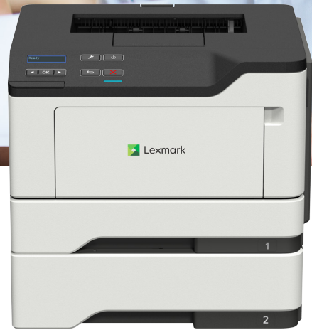
B2338dw with optional tray