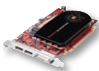
ATI FirePro™ V3750