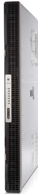
HPE Superdome 2 Server Blade (CB900s i6)