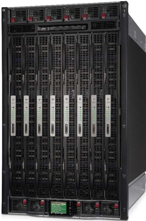
HPE Superdome 2 enclosure front