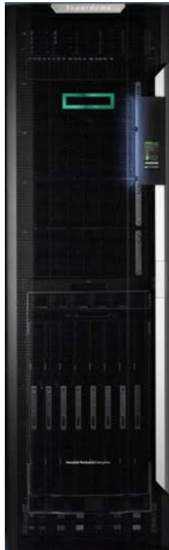
HPE Integrity Superdome 2