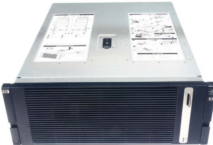
HPE Superdome 2 IOX