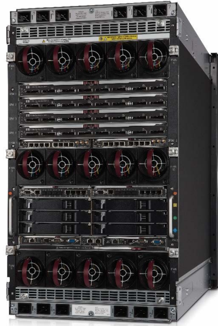
HPE Superdome 2 enclosure back