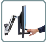
Monitor & Handle Kit (black) 97-760-009 Dual Monitor & Handle Kit (black) 97-718-009