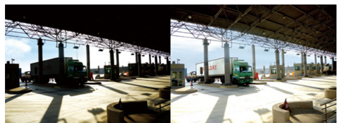
Without WDR Pro