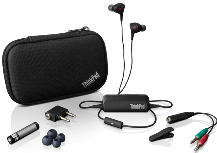
ThinkPad® Noise-Cancelling Earbuds