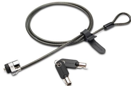
Kensington® MicroSaver Security Cable Lock by Lenovo®