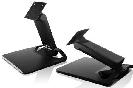
Lenovo® Universal All-in-One Stand