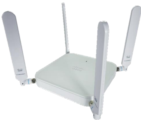
Figure 1. Cisco Catalyst Cellular Gateway

Cisco Catalyst Cellular Gateways connect your users and devices to trusted cloud and enterprise applications using 5G and 4G LTE Advanced Pro technologies. When combined with Cisco SD-WAN, they enable you to automate deployment, manage policies, and monitor network traffic over a cellular WAN with greater flexibility.