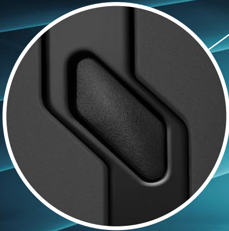
Four Adjustable DPI Steps