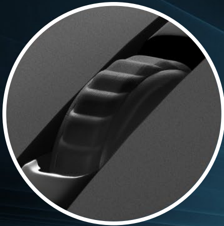
Precise Mouse Wheel