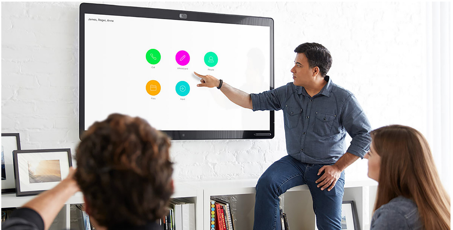
Figure 2. Meeting join on the Webex Board

The Webex Board 55S* is a fully self-contained system on a high-resolution 4K 55-inch LED screen. With an integrated 4K camera, embedded microphones, and a capacitive touch interface, the board brings intelligence, style, and usability to meeting rooms, from small to large. Designed with minimal wires for simplicity and elegance, Cisco's latest collaboration device allows