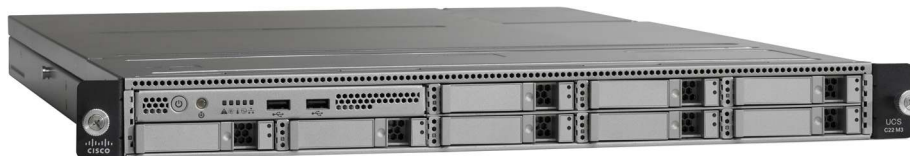
Figure 1. Cisco UCS C22 M3 Server

The Cisco UCS C22 M3 server interfaces with Cisco UCS using another unique Cisco® innovation: the Cisco UCS Virtual Interface Card 1225 (VIC 1225). The Cisco UCS VIC 1225 is a virtualization-optimized Fibre Channel over Ethernet (FCoE) PCIe 2.0 x8 10-Gbps adapter designed for use with Cisco UCS C-Series servers. The VIC is a dual-port 10 Gigabit Ethernet PCIe adapter that can support up to 256 PCIe standards-compliant virtual interfaces, which can be dynamically configured so that both their interface type (network interface card [NIC] or host bus adapter [HBA]) and identity (MAC address and worldwide name [WWN]) are established using just-in-time provisioning. In addition, the Cisco UCS VIC 1225 can support network interface virtualization and Cisco Data Center Virtual Machine Fabric Extender (VM-FEX) technology.