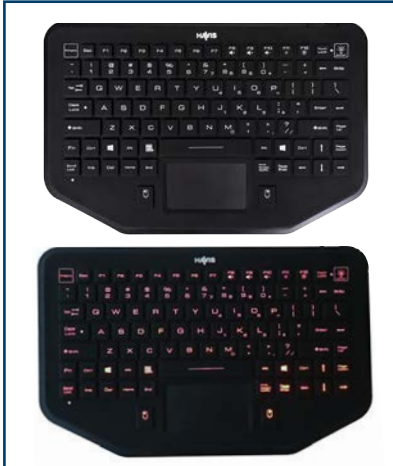
One touch button illuminates red monochrome backlight