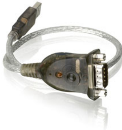
USB to Serial RS-232 Adapter (GUC232A) USB 1.1 to Serial Converter Cable