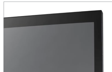
A true flat surface and edge-to-edge glass overlay for best touch experience