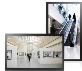
Flexible display orientations suit preferred content layouts